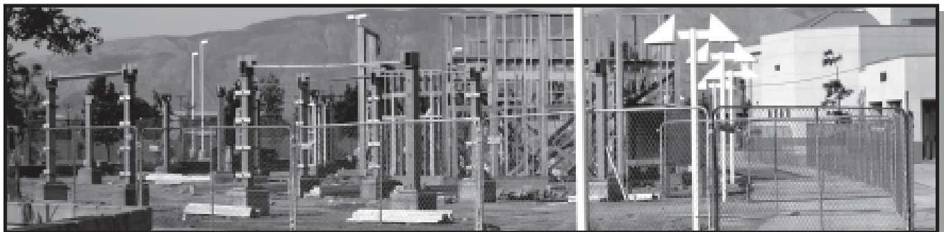
Tahquitz High School Stadium Construction

* Budget will be adjusted/increased when the second series of bonds are issued