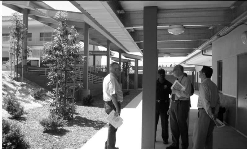
PROJECT SITE VISITS